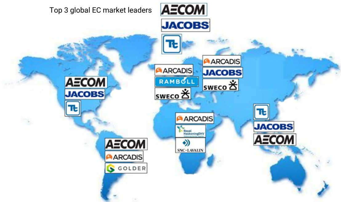
Global Market Leaders by Region, 2018